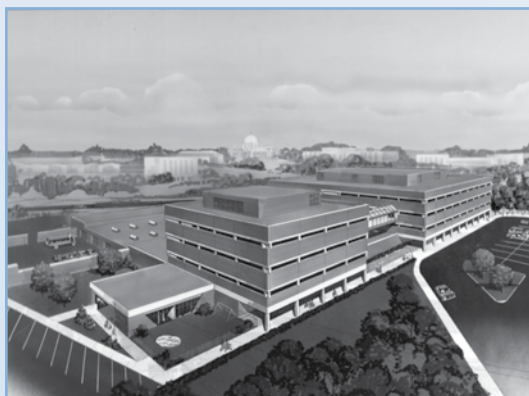
1988 A new tower was added to the present location at Marshall Avenue and John Ireland Boulevard.