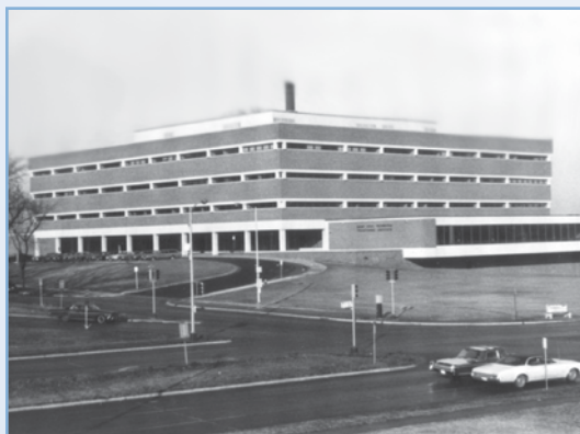
1966 St. Paul Technical Vocational Institute at Marshall Avenue and John Ireland Boulevard.

This is an exciting time for the College. We are experiencing unprecedented growth and now offer 34 associate degree programs, and 70 occupational certificate and diploma programs. We’ve wrapped up Phase I of our third major remodeling project. In 1989, we added the west tower to the campus, and in 2000, we completed a major remodeling of the main building’s first floor. In 2008, Phase I of a $23 million project was completed in our lower level and we’re currently working on Phase II which will include new landscaping.