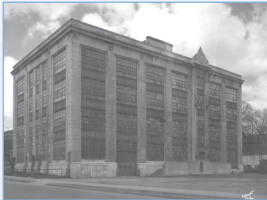
1923 St. Paul Vocational High School at Jackson and 14th Streets.