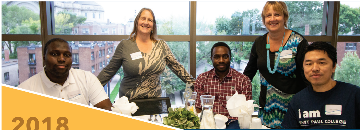
Scholarship recipients had the opportunity to meet and thank scholarship donors in person at the 2018 Scholarship Recognition Breakfast.